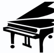
Keyboards and/or Piano